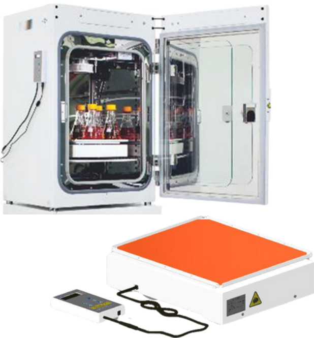
Orbital Shaker - CO2 Resistant (OSC-26M)

Developed to help you economically scale-up cell production in your existing CO2 Incubator. Designed with sealed electronics to minimize heat disruption and ensure that conditions in the CO2 chamber are not affected.