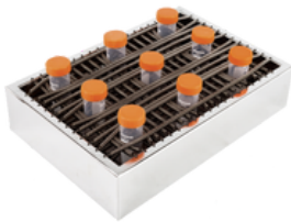
Mini Universal Spring Platform