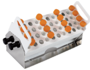
Adjustable Tube Rack