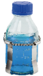
Infusion Bottle Clamp