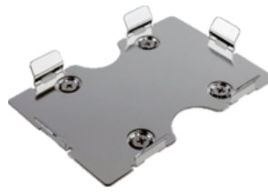
96-Well Micro-Plate Holder