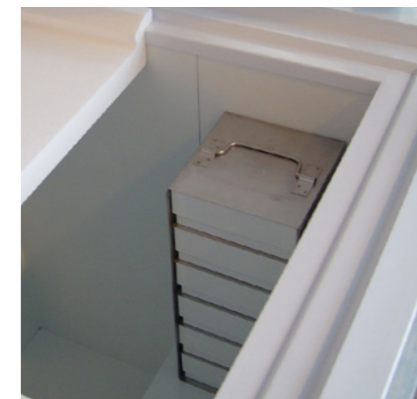
Inner lids (left hand side) which are mandatory for optimized function